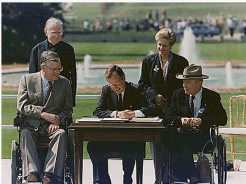
Then President George H.W. Bush signing The ADA into law, June 1990