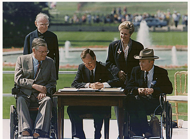
Then President George H.W. Bush signing The ADA into law, June 1990

Today, The ADA prohibits discrimination against people with disabilities and guarantees that people with disabilities have the same opportunities as everyone else to enjoy employment opportunities, purchase goods and services, and participate in state and local government programs.